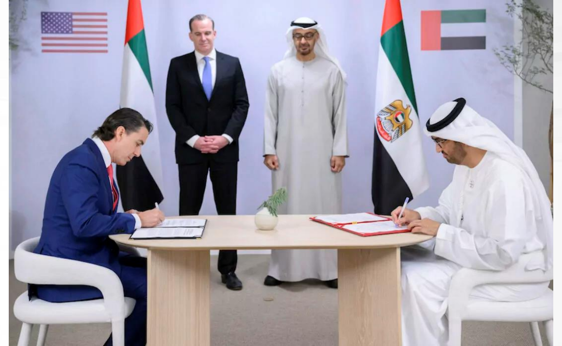
COP28 President-Designate HE Dr. Sultan Al Jaber and US Special Presidential Coordinator Amos Hochstein